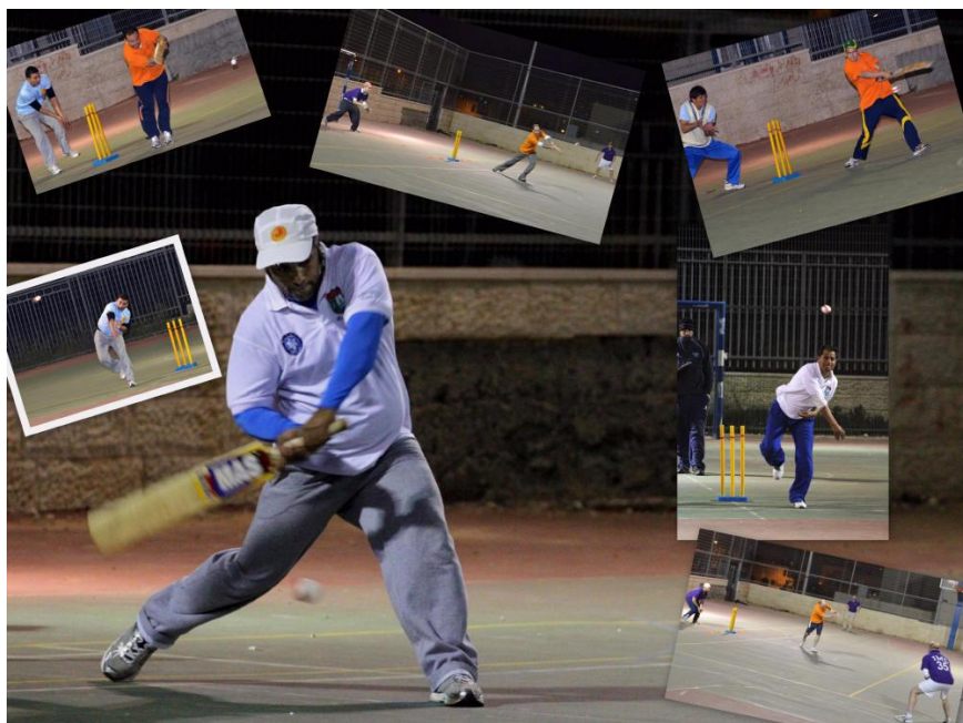
Night League Table 2012/2013

The Night Action Cricket League is heading towards the Play Off stage, with the top 2 positions earning an automatic place into the semi finals while teams finishing in positions 3-6 will have to play in a knock out match, with the winners reaching the semi finals. In what has been a remarkably close season, the league has already seen two tied matches, (Dialogz Dragons and Super Lions Lod) and (Yagod Morris Cricket 'A' and Gold Insurance Bet Shemesh Lightning) which resulted in two Super Over Matches.