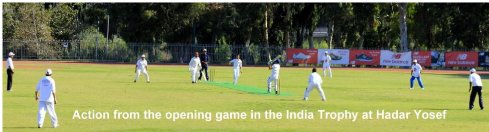
Action from the opening game in the India Trophy at Hadar Yosef